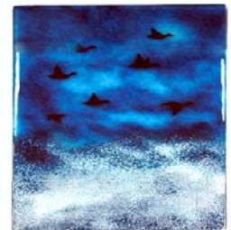
Below: Migration, Turquoise, 45x45cm, wall panel by Joanne Mitchell